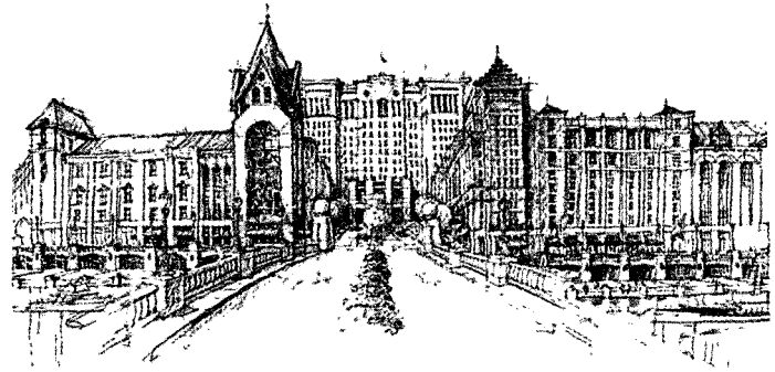
©2001 Carousel Center