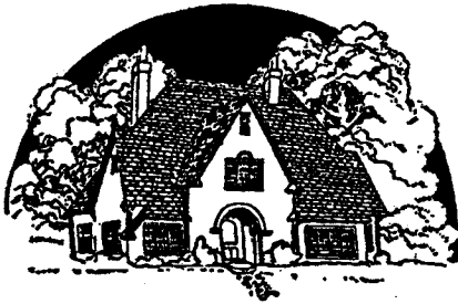
Not for Chinese?

If, for example, there is a straight line from front door to back door, the family's cosmic energy may flow in and out of the house too quickly. If there is a tree directly in line with the front door, it may hinder the entry of energy