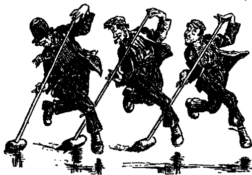
Loyal town employees.

The town of Harrison (NJ) has always had a policy of hiring only residents for public jobs. Many municipalities have such a policy because people are loyal to their towns