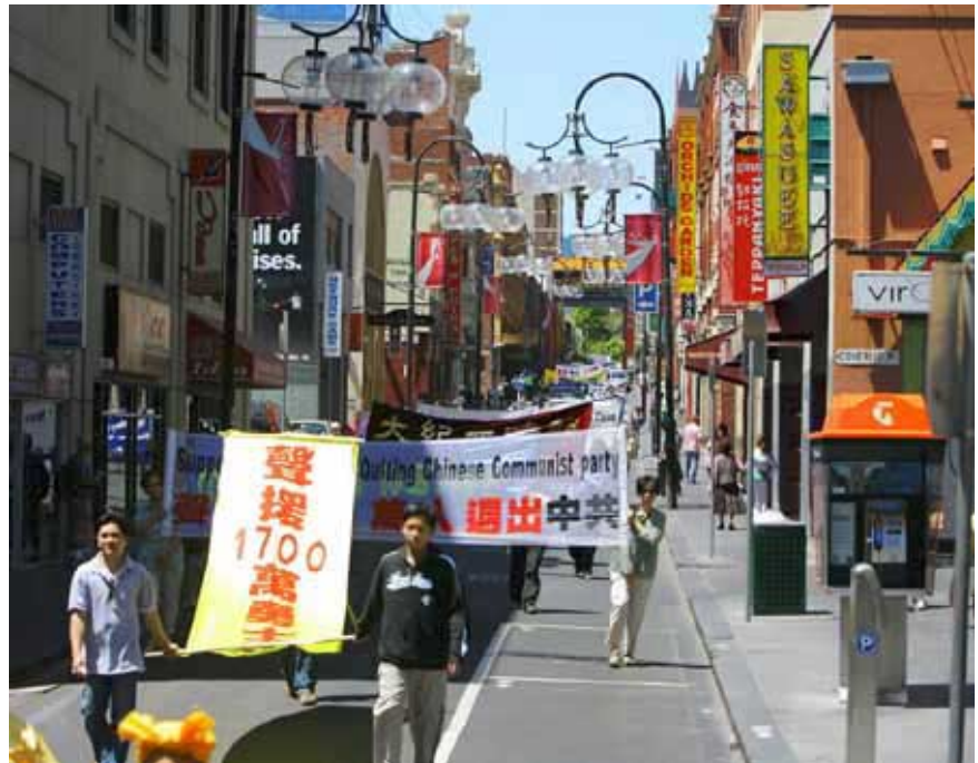
Chinese demonstrating in Melbourne, Jan. 13, 2007.