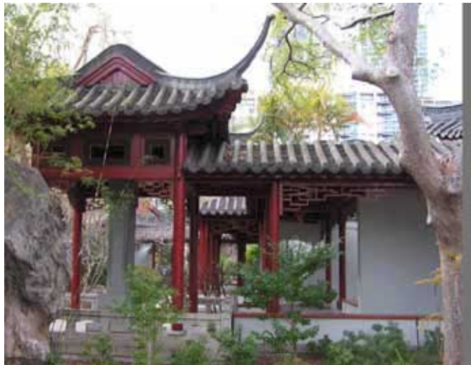
Chinese Garden of Friendship, Sydney.