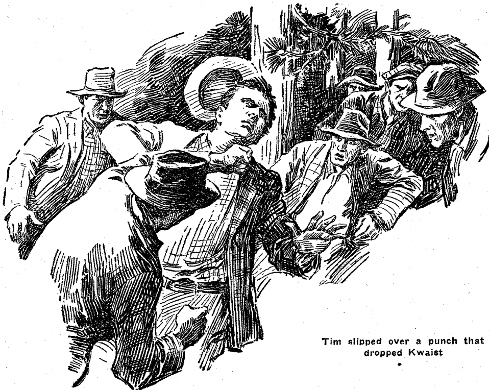
Tim slipped over a punch that dropped Kwaist