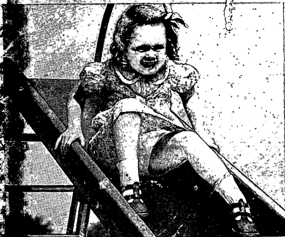
OUTDOOR PICTURES like this taken on a cloudy day without flash unit. No more waiting for the sun to shine!