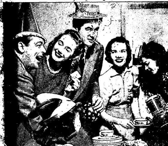
INDOOR FLASH! Needle-sharp photos like this that enlarge beautifully up to 8" x 10"! Double your fun!