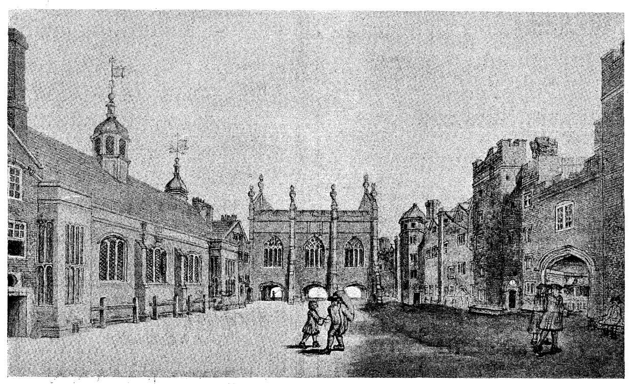
From The Romance of Lincoln's Inn Fields By E. Beresford Chancellor (Richards Press).