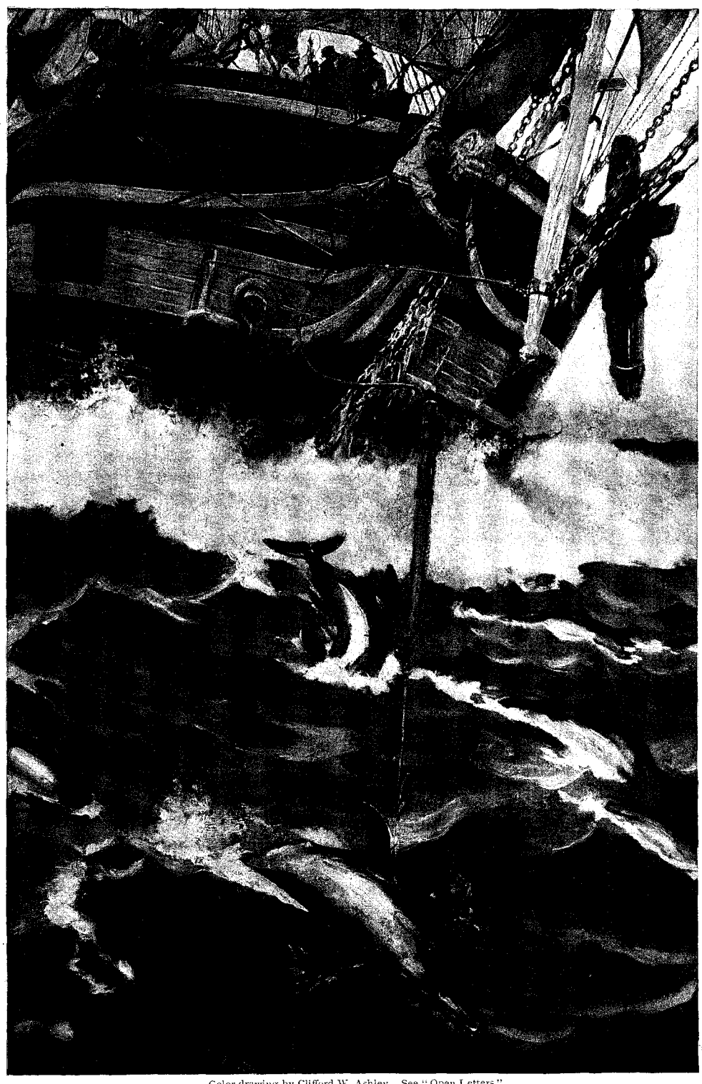
Color drawing by Clifford W. Ashley. See "Open Letters"