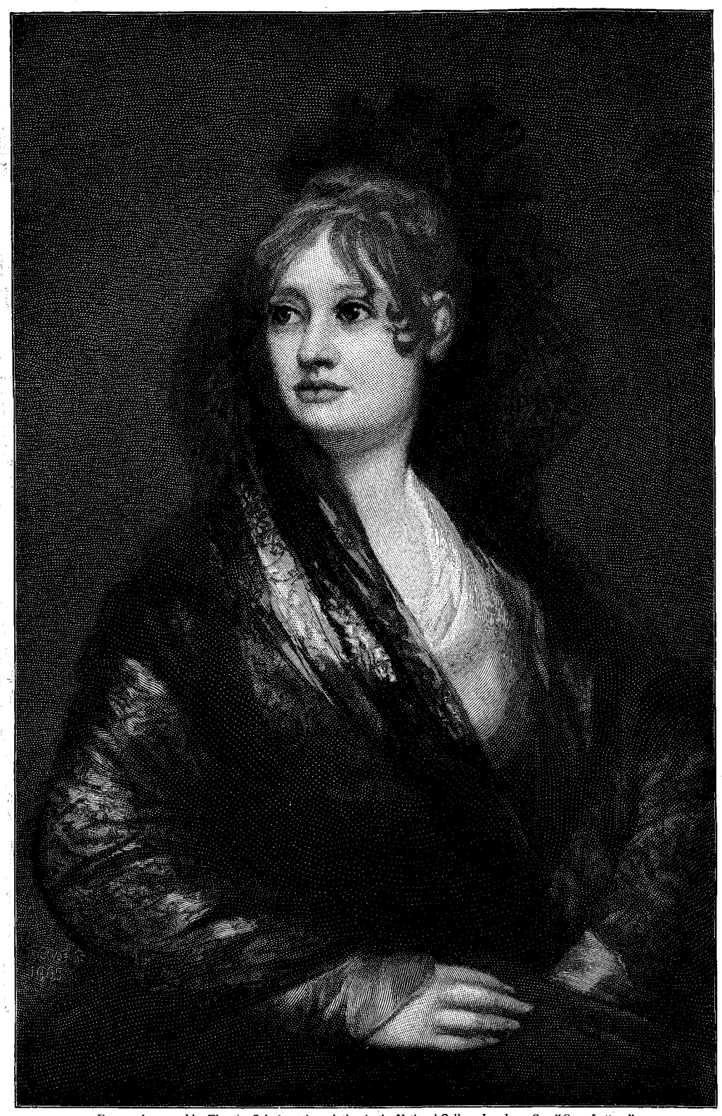
Engraved on wood by Timothy Cole from the painting in the National Gallery, London. See "Open Letters" DOÑA ISABEL CORBO DE PORCEL, BY GOYA