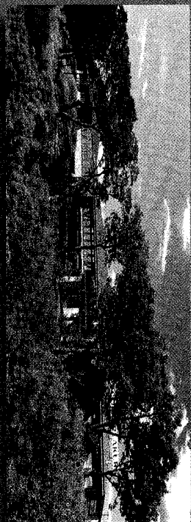
Beautiful riverfront accommodations at Rockford's premier hotel: Cliffbreakers River Suites Hotel ( www.cliffbreakers.com )

Read Beowulf in the context of the people who gave birth to this first masterpiece of English, follow Bede's brilliant account of the Church in England, and examine up-close the institutions of a free people that have set an enduring pattern for all of us who value liberty and understand that the Christian life properly lived is the greatest adventure of all.