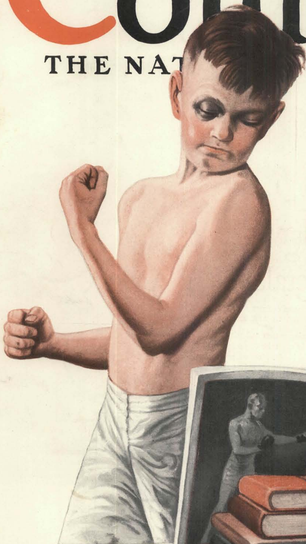
Cover by Phil Cook