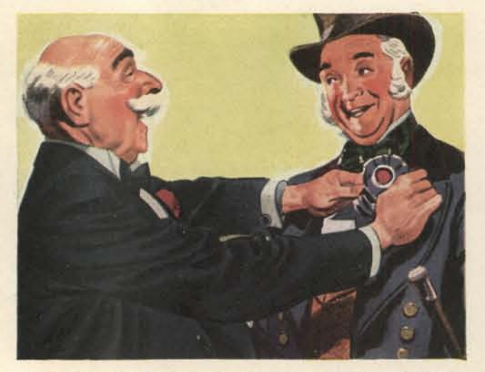
"YOU SHOULD HAVE SEEN THE MAJOR. '17 rare flavors,' he roared. 'No wonder your gin has such matchless taste! Why, it rates a medal for distinguished flavor and superb bouquet...your Tom Collins proved it!'"

"THEN JUST AS A FAMOUS CHEF blends his sauces, I skillfully blend these rare flavors into one delightful whole. The result is a gin so s-m-o-o-t-h you can drink it straight ."