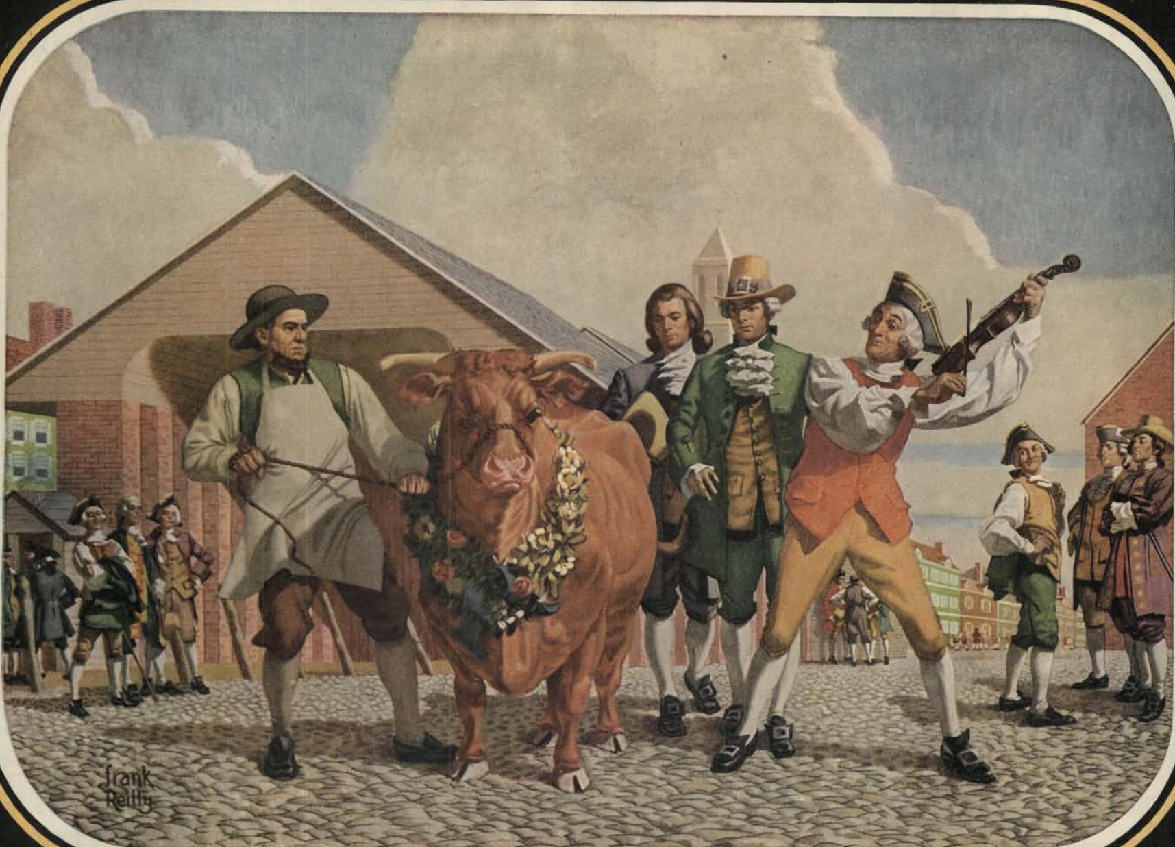
BULL DECORATED FOR THE "BUTCHER PARADE," SECOND STREET MARKET, PHILADELPHIA, 1788*