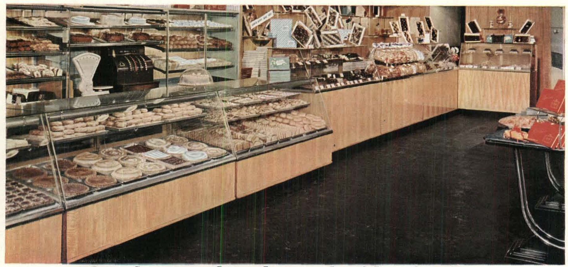
There's one other change besides the floor