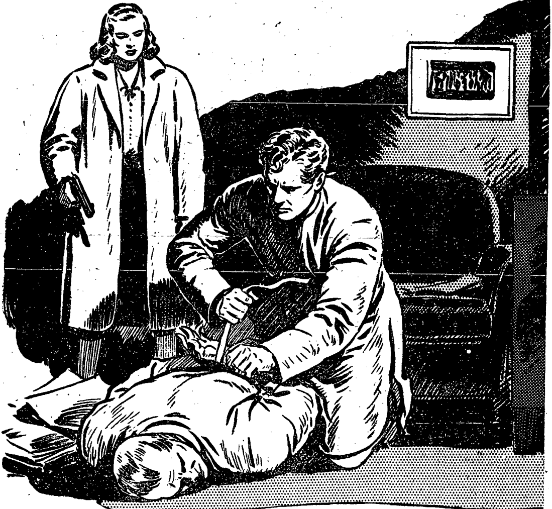
While Clare Logan held the gun steady in her hand, Tom Finley tore off a long piece of

"Right!" said Tom, grimly, "We're out of the ward, but how do we get out of the hospital?"