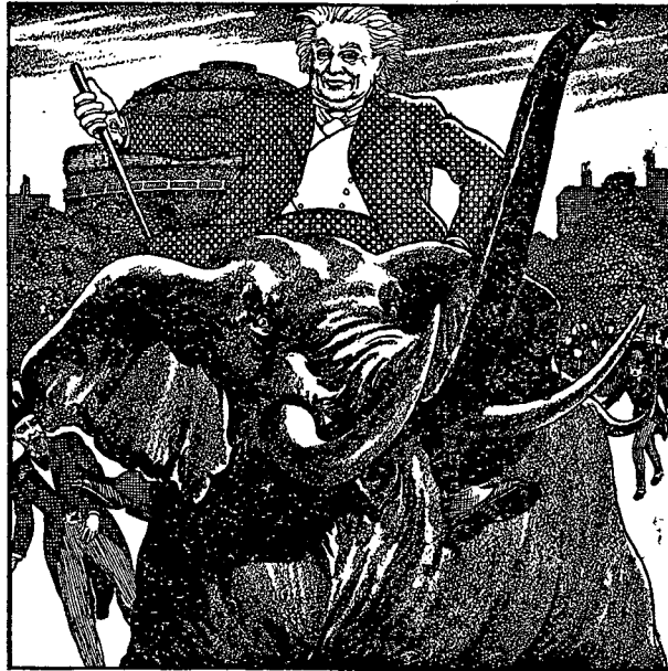
They went at such a rate that Syme saw the Albert Hall in Kensington when he thought he was still in Paddington

"We have one more chance," said Syme, taking the steel out of his mouth. "Whatever all this pandemonium means, I suppose the police station will help us. We can't get there, for they hold the way. But there's a pier or breakwater runs out into the sea just here, which we could defend longer than anything else, like Horatius and his bridge. We must defend