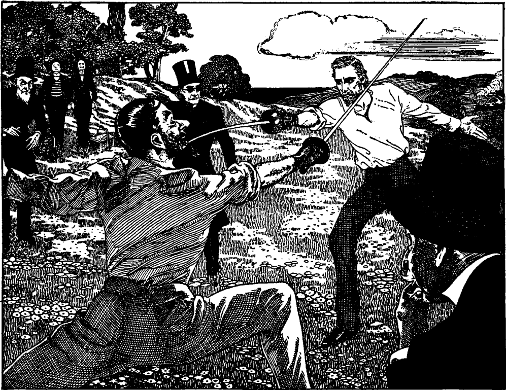
Half-mad, Syme thrust, and made what should have been a bloody scar on the Marquis's cheek. But there was no scar.

he insisted on the need for a furious and incessant energy, rending all things in pieces. Energy, he said, was the All. He was lame, short-sighted, and partially paralytic. When I met him I was in a frivolous mood, and I disliked him so much that I resolved to imitate him. If I had been a draughtsman I would have drawn a caricature. I was only an actor, I could only act a caricature. I made myself up into what was meant for a wild exaggeration of the old Professor's dirty old self. When I went into the room full of his supporters I expected to be received with a roar of laughter, or (if they were too far gone) with a roar of indignation at the insult. I cannot describe the surprise I felt when my entrance was received with a respectful silence, followed (when I had first opened my lips) with a murmur of admiration. The curse of the perfect artist had fallen upon me. I had been too subtle, I had been too true. They thought I really was the great Nihilist Professor. I was a healthy-minded young man at the time, and I confess that it was a blow.