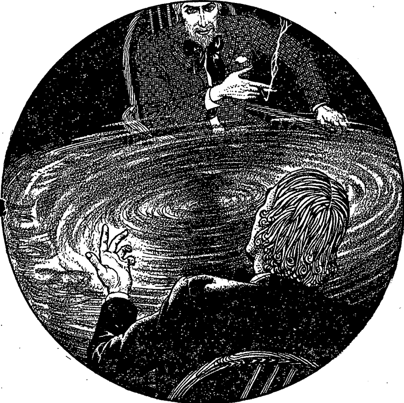
Suddenly the table began to whirl, as if at an insane séance