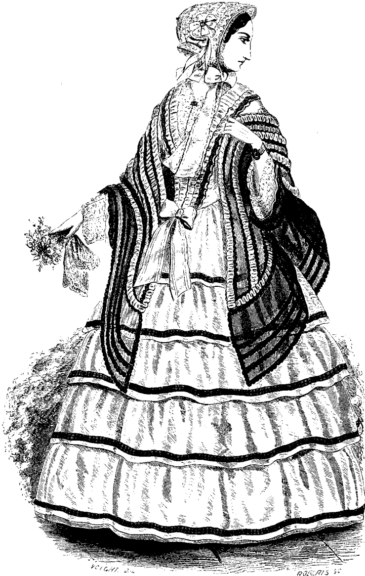
FIGURE 1.—FULL DRESS FOR VISITS.