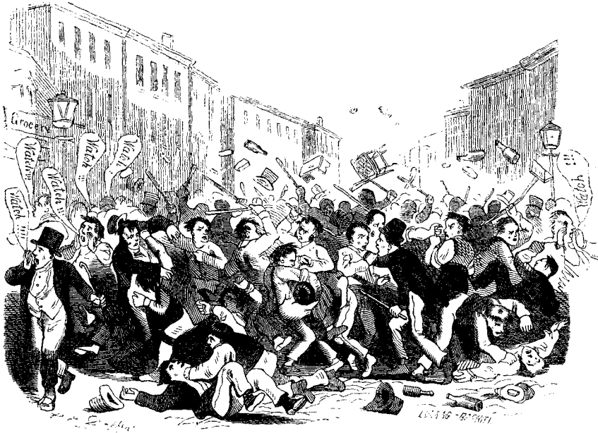
A ROW IN THE SIXTH WARD.