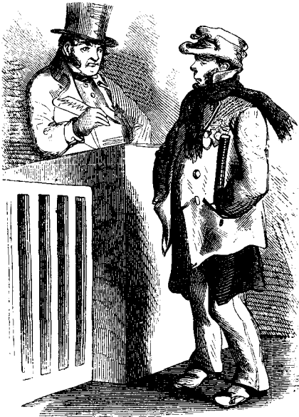
THE OLD POLICEMAN GIVING HIS REPORT.