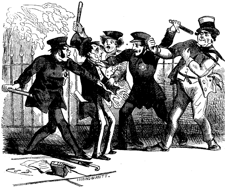
HOW THE POLICE USED TO PREVENT A FIGHT.