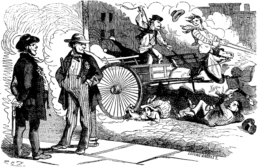
THE OLD POLICE AND THE BUTCHER CARTS.

AS THEY WERE, WITH A GLANCE AT THEM AS THEY ARE TO BE.