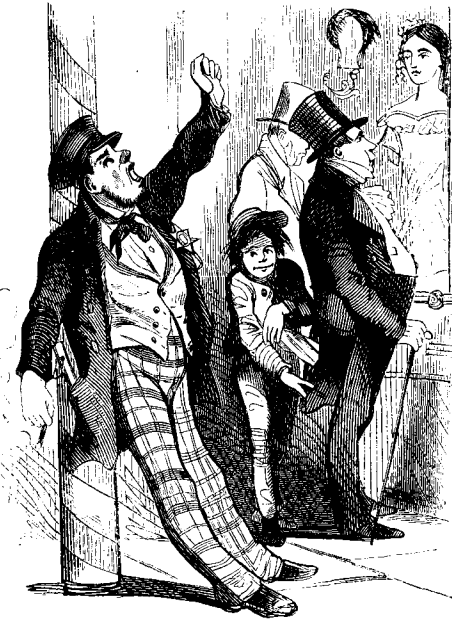
THE OLD POLICEMAN ON DUTY.