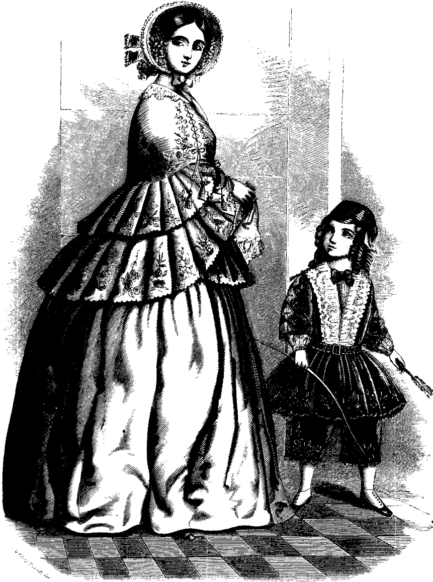
FIGURES 1 AND 2.—PROMENADE COSTUME AND CHILD'S DRESS.