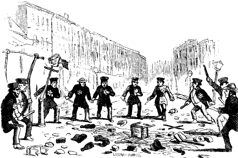
THE POLICE ON THE GROUND WHEN THE FIGHTING WAS ALL OVER. VOL. X.—No. 58.—N o *