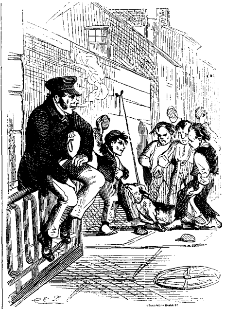
THE OLD POLICEMAN ENJOYING HIMSELF.