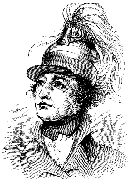
COLONEL BENJAMIN TALLMADGE. [FROM A PENCIL SKETCH BY COLONEL JOHN TRUMBULL.]

remonstrances of Major Tallmadge, would have been sent back to Arnold. He was with the prisoner almost continuously, and was