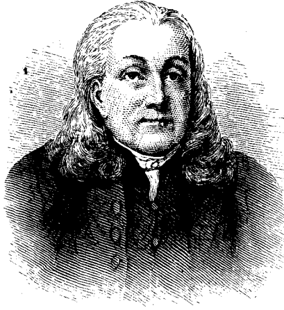
TAPPING REEVE. [FROM A DRAWING BY GEORGE CATLING.]

Continental army, and four became general officers, four became members of Congress, two Chief Justices, and two Governors of the State. An anecdote of the same period shows that the women of the Hill were no less accomplished than their lords, and that they won admiration abroad as well as at home. Among the ladies at the national capital during the second administration of Washington, none was more noted for personal attractions