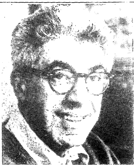
Barry Commoner author, The Politics of Power

In These Times fills an urgent need for facts and ideas that can help the people of the U.S. learn how to govern their own future.