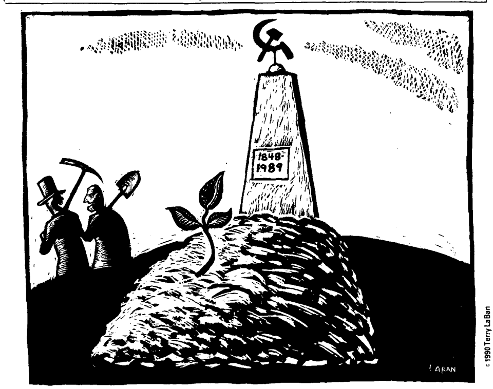
By David M. Kotz

printing equipment, and it licenses technologies to Western corporations. In 1987 per capita gross domestic product (GDP) in the East Germany was $12,000, about equal to that of France and $2,000 below the level of West Germany. Czechoslovakia's per capita GDP was $10,000, about equal to that of Britain, while the USSR's GDP per capita was $8,700.