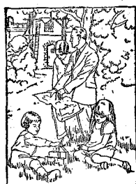
Age of Getting Started