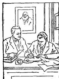
Age of Surplus Earnings