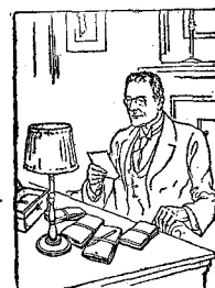
Age of Declining Earnings