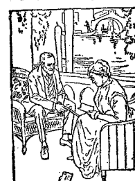
Age of Retirement