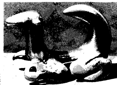
Fossil Lakes from the Eocene