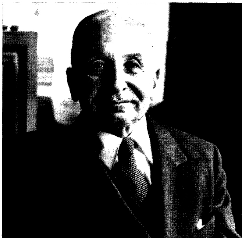
Ludwig von Mises (1881-1973)

Throughout six decades, this man challenged and changed the way economists think.