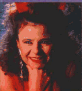
Fox's First Lady