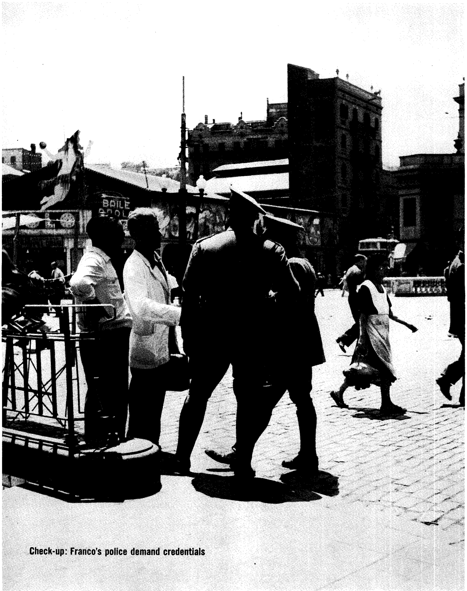
Check-up: Franco's police demand credentials