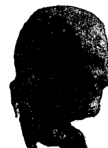
WM. ALLEN WHITE

IF you are a bookish person, you have probably heard about the Book-of-the-Month Club. Many of the most prominent people in the country have already subscribed to its service. Wherever books are talked about, it is likely to come into the conversation. Frequently, however, the simple idea behind it seems to be misunderstood.