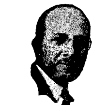
HENRY SEIDEL CANBY