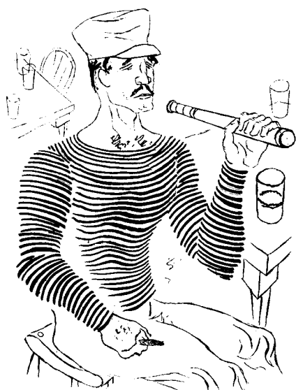
—Sketch by the author.

There was, for instance his bibulous roommate, wealthy Big Boy, chronically afflicted with DT's and incessantly in search of comely "tomatoes" to sample; there was an aggressive, acquisitive, soul-examining Pamela, unhappily retreating from marital memories; there was a lusty, Kansas-