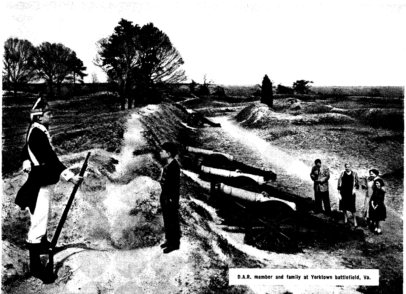
D.A.R. member and family at Yorktown battlefield, Va.

They were 13 tiny American colonies — untrained, ill-equipped, dis-united — pitted against the overwhelming might of the British Empire. If their Revolution was successful, it would be a miracle.