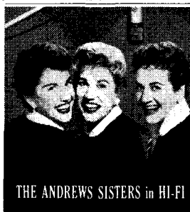
THE ANDREWS SISTERS in HI-FI

FOR COMPLETE CATALOG WRITE: EXPERIENCES ANONYMES 20 East 11th Street, New York 3