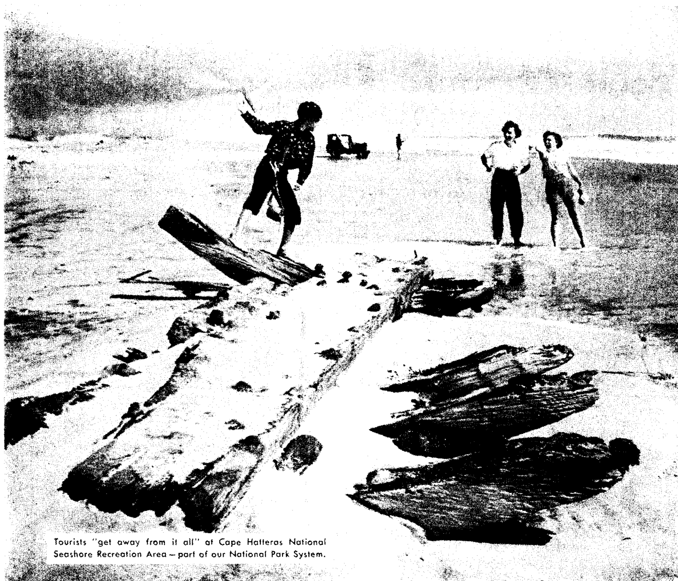
Tourists "get away from it all" at Cape Hatteras National Seashore Recreation Area — part of our National Park System.