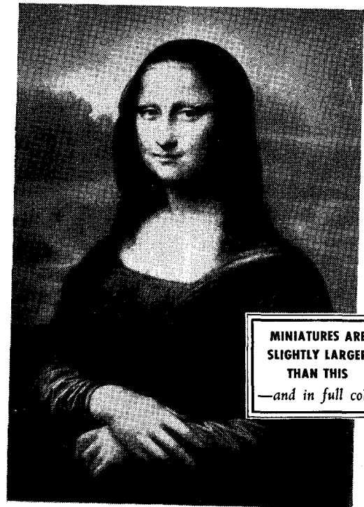
LEONARDO DA VINCI: MONA LISA

PLEASE NOTE: Since the Metropolitan Museum is unequipped to handle the details involved in this project, it has arranged to have the Book-of-the-Month Club act as its national distributor. The selection of subjects and the preparation of the color prints remain wholly under the supervision of the Museum.