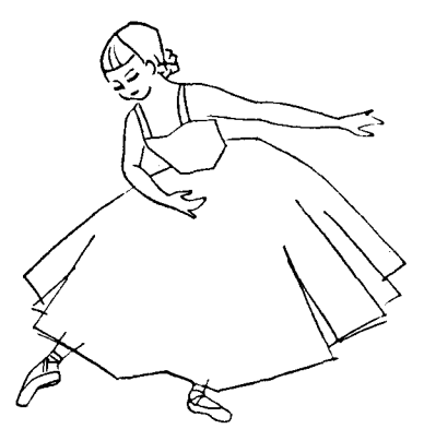
-From "Young Dancer's Career Book."