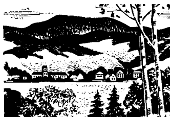
Bread Loaf, Vermont

Housing facilities are limited and must be assigned to the earliest applicants.