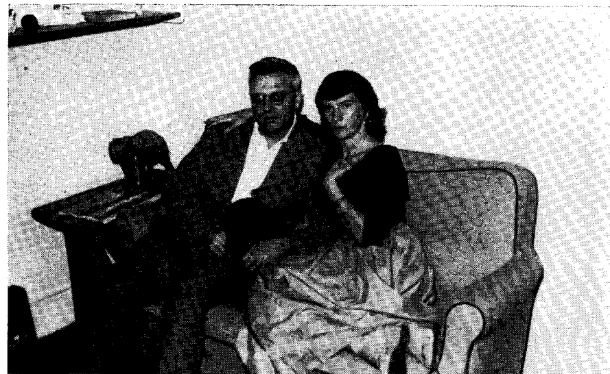
—From the book.