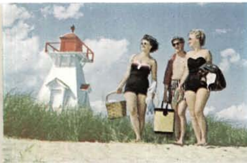
Seen near Shediac