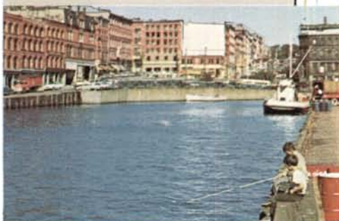
Harbour at Saint John.