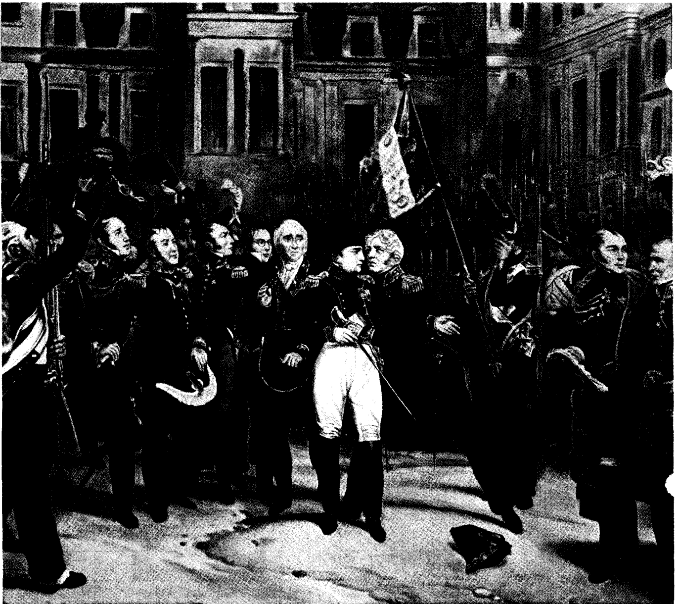
Adieux de Napoléon à La Garde Impériale à Fontainebleau. Détail de la peinture par E.J.H. Vernet.