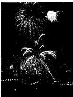
Fireworks at the Canadian National Exhibition, Toronto, Canada.

Sports loving Canadians have a ready welcome for fellow enthusiasts be it sailing, skin diving, swimming, or water skiing on warm Canadian lakes. Golf on championship courses, fish, hike, there's great sport everywhere in Canada. You'll enjoy fine restaurants in modern cities, featuring international cuisine and top entertainment. The only difficult thing about a Canadian Holiday is deciding what you want to do most. To help you plan send for your Canadian Holiday Kit listing many events to add spice to your vacation.