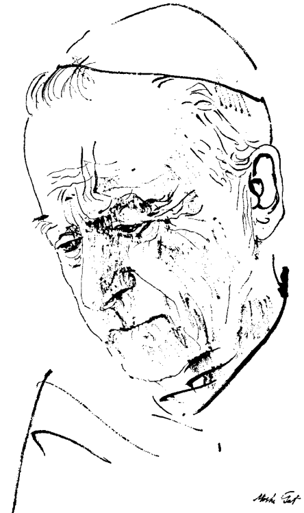
—Sketch by Moshe Gut, reproduced with the permission of the Cultural Department of The Israeli Foreign Ministry.

The translator who proposes to render each word literally. . . . will meet with much difficulty. . . . The translator should . . . state the theme with perfect clarity in other languages . . . so that the subject be perfectly intelligible in the language into which he translates.