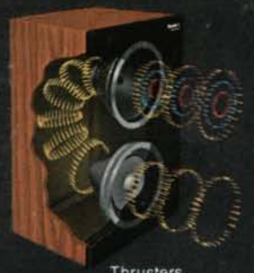
For an extra thrust of bass

Systems 2000™ from Panasonic. A compact stereo system that's more sophisticated than conventional compact systems. Yet still very easy to live with.