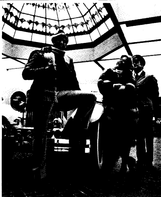
Photographed at the Stanford Court