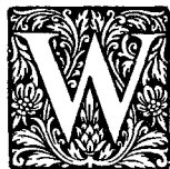
ILLUSTRATION BY JAMES MONTGOMERY FLAGG

WHEN Ainsley first moved to Lone Lake Farm all of his friends asked him the same question. They wanted to know, if the farmer who sold it to him had abandoned it as worthless, how one of the idle rich, who could not distinguish a plow from a harrow, hoped to make it pay? His answer was that he had not purchased the farm as a means of getting richer by honest toil, but as a retreat from the world and as a test of true friendship. He argued that the people he knew accepted his hospitality at Sherry's because, in any event, they themselves would be dining within a taxicab fare of the same place. But if to see him they travelled all the way to Lone Lake Farm, he might feel assured that they were friends indeed.