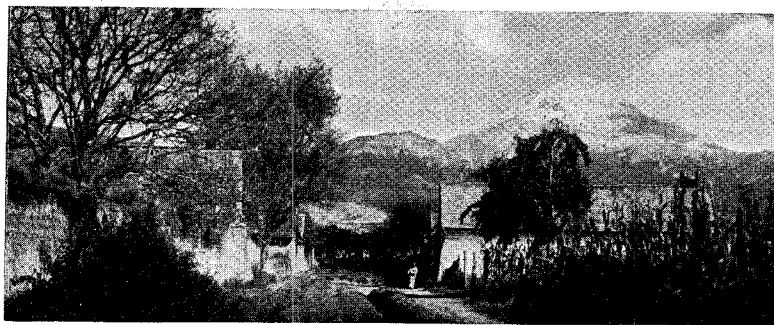
POPOCATEPETL FROM A LITTLE VILLAGE IN THE VALLEY OF MEXICO

It seems absurd after all that Stuart Chase and others have written about Mexico in the last few years, that the first things that come to mind still,