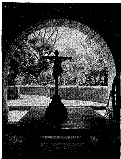
THE CONVENT OF CHURUBUSCO, MEXICO

Here every spot is sacred. But beyond your memories of exquisite or frenzied allegorical dances will endure the impression of a rare people, beautiful and proud.