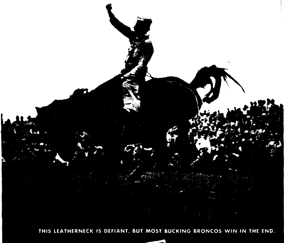
THIS LEATHERNECK IS DEFIANT, BUT MOST BUCKING BRONCOS WIN IN THE END.