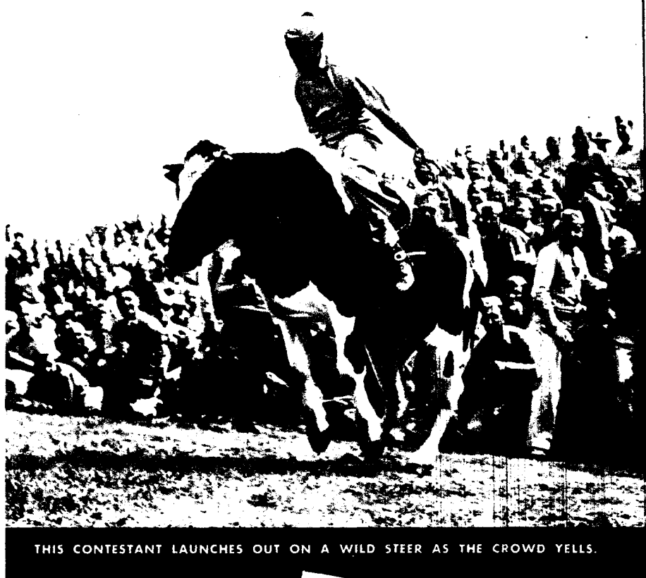
THIS CONTESTANT LAUNCHES OUT ON A WILD STEER AS THE CROWD YELLS.