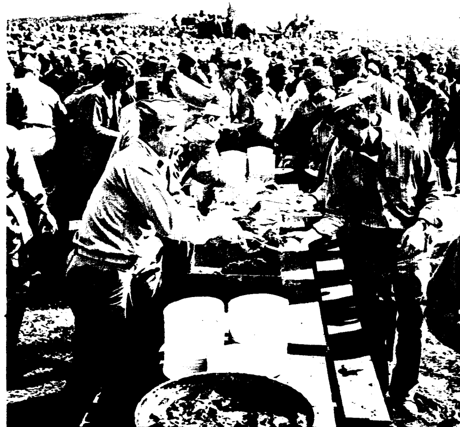
MARINES LINE UP AT BARBECUE TABLE. OVER 200 COOKS AND MESSMEN FED THEM.